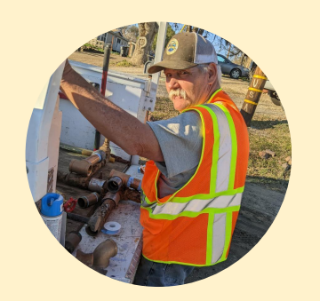
Our 7 Talented State Certified Operators