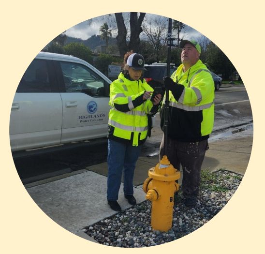
Trimble GPS Mapping Tool