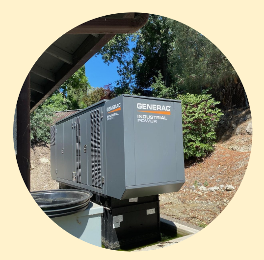
New Generator System