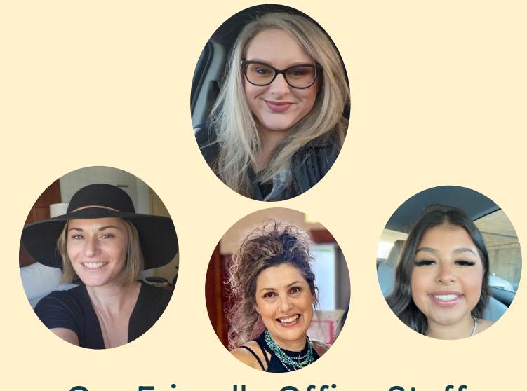
Our Friendly Office Staff

3 - Treatment Level 3 Operators Over 50 years collective experience